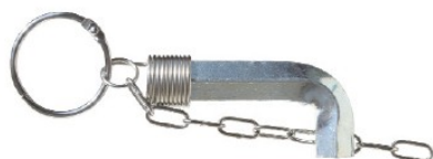
Special key for sizes from M8 to M30